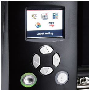
Color TFT LCD and operation panel for easy and intuitive operation

All metal mechanism design featuring die-cast center plane and base make EZ2250i series perfect for high volume applications