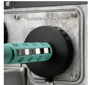
Automatic self adjustment for coated inside/outside ribbons